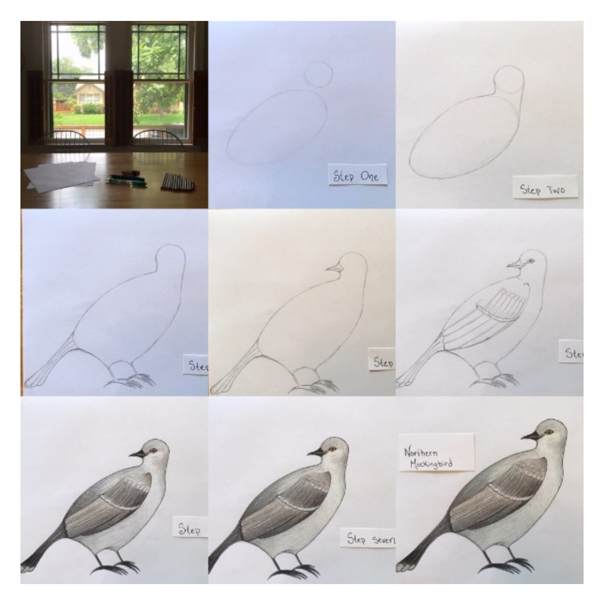
How To: Draw Birds

Every fledgling birder needs to be able to sketch their finds!